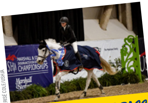
GOLDEN BACKSTAGE PASS